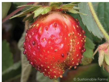
Under-pollination results in smaller, misshapen fruit such as this strawberry.

Insect populations are in decline worldwide due to land clearing, intensive or monocultural agriculture, pesticide use, pollution, colony disease, increased urbanisation and climate change. Low pollinator numbers mean not all flowers are pollinated, leading to low fruit or seed set. This in turn reduces fruit and vegetable harvest yields, and decreases food supply.