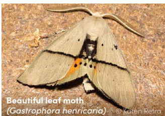
Beautiful leaf moth ( Gastrophora henricaria )

Butterflies have wings covered in tiny scales. They have clubbed antennae and hold their wings upright when at rest. They are day-flying and have long tongues that they can use to feed on nectar in flowers with deep tubes. Butterflies are usually brightly coloured, with approximately 600 species found in Australia.