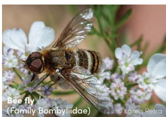
Bee fly (Family Bombyliidae)

Australian native bees comprise more than 2000 species, which provide essential pollination services. Native bees are generally solitary and live in nests in the ground or in hollow stems, old borer holes and other cracks and crevices, and some have evolved to pollinate particular native flowers through 'buzz pollination'. Although many Australian native bees are generalist foragers, some species have co-evolved with native plants and adapted to be the most effective pollinators of their flowers. Many native plant species, such as Dianella and Grevillea require specially adapted insects to access their nectar and enable the transfer of pollen to the stigma. Most native bees are solitary, but some species found in northern Australia ( Tetragonula sp. and Austroplebeia sp.) are social bees and are used for commercial pollination of crops like macadamia nuts.