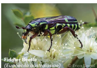
Fiddler Beetle ( Eupoecila australasiae )

Hoverflies are a type of fly, distinguishable by their large eyes, short antennae, bright black and yellow abdomen and their hovering flight behaviour. Adult hoverflies are nectar and pollen feeders. Hoverfly larvae feed on pests such as aphids, thrips and leafhoppers and are excellent biocontrol agents.