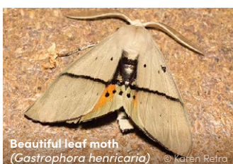
Beautiful leaf moth ( Gastrophora henricaria )

Butterflies have wings covered in tiny scales. They have clubbed antennae and hold their wings upright when at rest. They are day-flying and have long tongues that they can use to feed on nectar in flowers with deep tubes. Butterflies are usually brightly coloured, with approximately 600 species found in Australia.