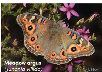
Meadow argus ( Junonia villida )

Beetles have hard outer wings that form their distinctive beetle shape. Their outer wings form a T-shape where they join at the top, unlike bugs where the outer wings make an X- or Y-shape. Some beetles feed on nectar and pollen, usually by crawling over flower surfaces. There are around 30,000 species of beetles in Australia, with many yet to be formally described.