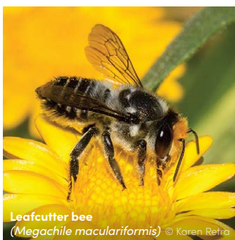
Leafcutter bee ( Megachile maculariformis )

Honey bees have become an important part of the Australian landscape. Honey bees live as colonies, and have a long history of coexistence with humans, including in domestic gardens.