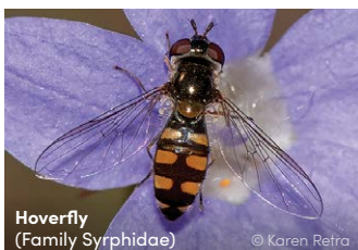
Hoverfly (Family Syrphidae)

Fly species number up to 30,000 in Australia, and can be identified by having only one pair of flight wings. A second set of wings are modified into club-shaped paddles that allow flies to hover and stabilise their flight. Unlike bees and wasps, many flies (Brachycera) have very small, clubbed antennae at the front of their head. Flies, including blowflies, are often attracted to flowers that smell like carrion. Some flower-flies, have hairy bodies that easily collect pollen while they are feeding. Flies provide a range of services in the garden, including pollination, decomposition and predation.