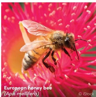
European honey bee ( Apis mellifera )